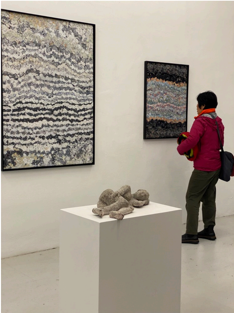
Exhibition: „Über die Textile hinaus“ Galerie FOE München, 2024