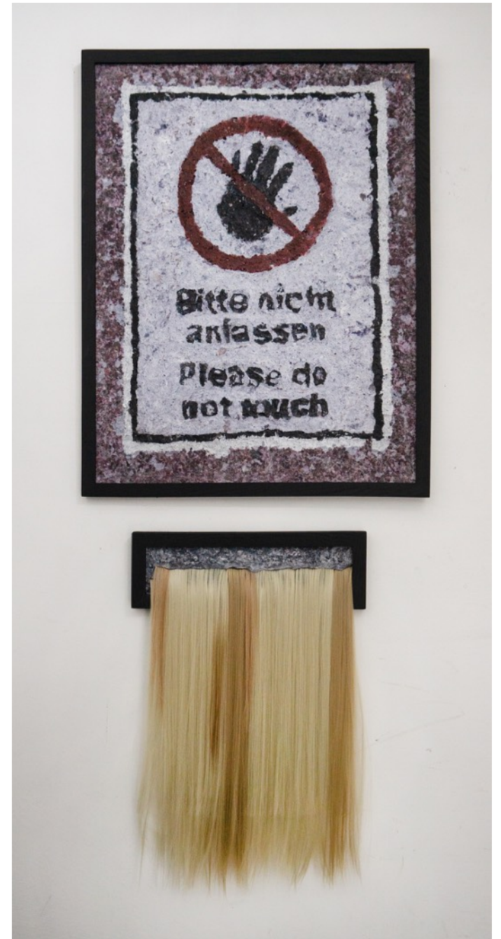
"Please do not touch", Textilsteinon, pigment, synthetic hair, 162x67 cm