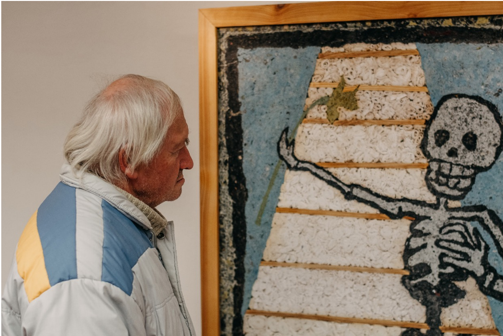
Exhibition: „věčnost, fosilie, antropocén“ Galerie Evropského Domu Pilsen, 2024