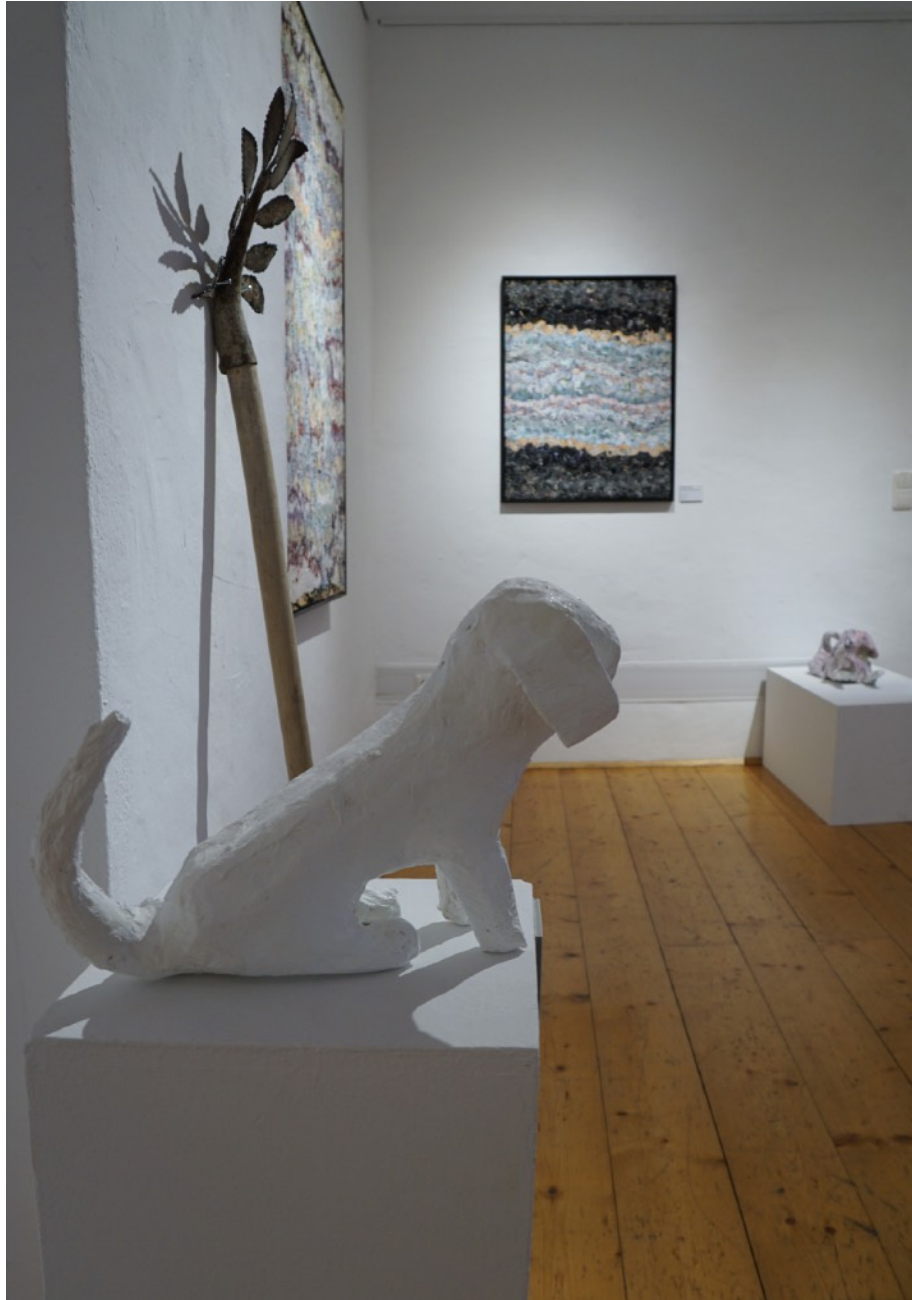
Exhibition: „perspektiven“ 44 Galerie Leonding, 2025