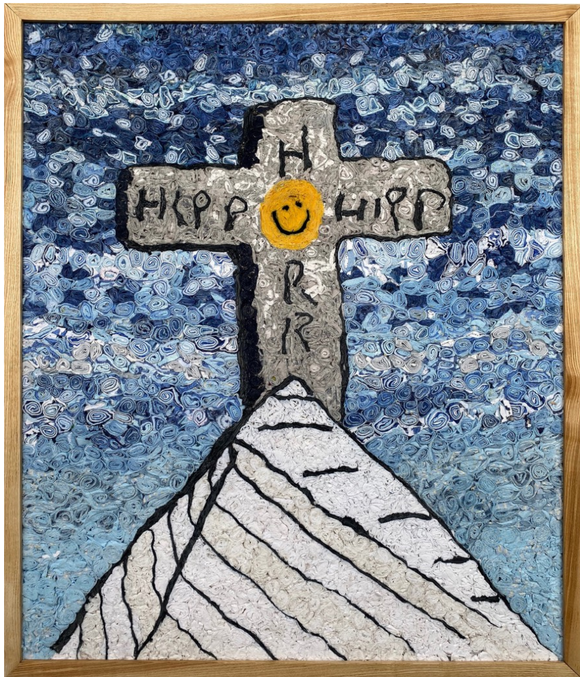
“Hipp Hipp Hurra“, Textilstein, 105x90 cm