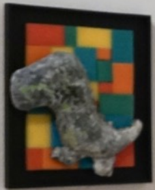
Small white label with text and a red dot, likely identifying the artwork.