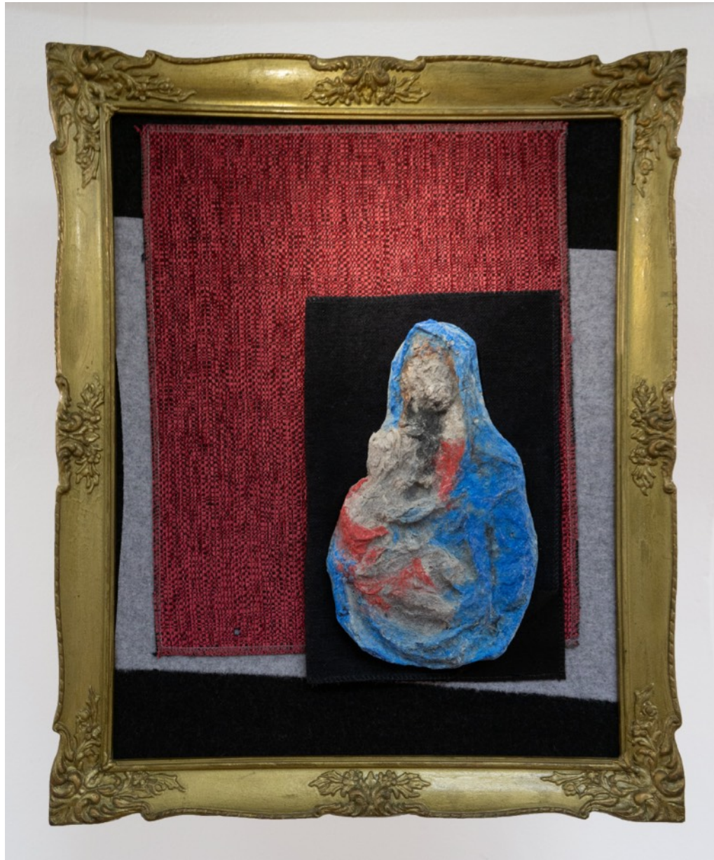
“Madonna“, Textilsteinoton, pigment, fabric, 60x45 cm