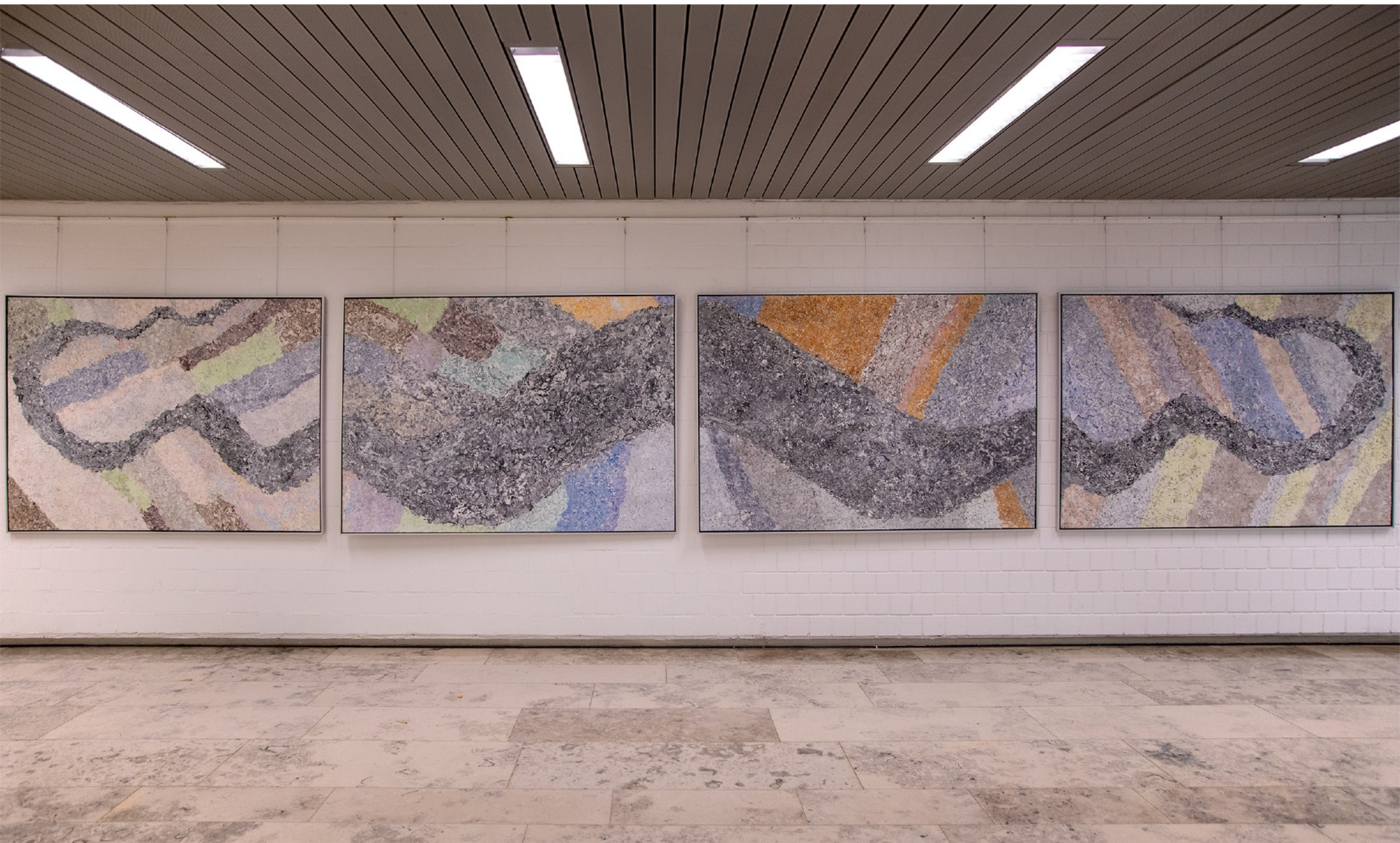
„infinite wave“, Textilstein, a' 760x140 cm