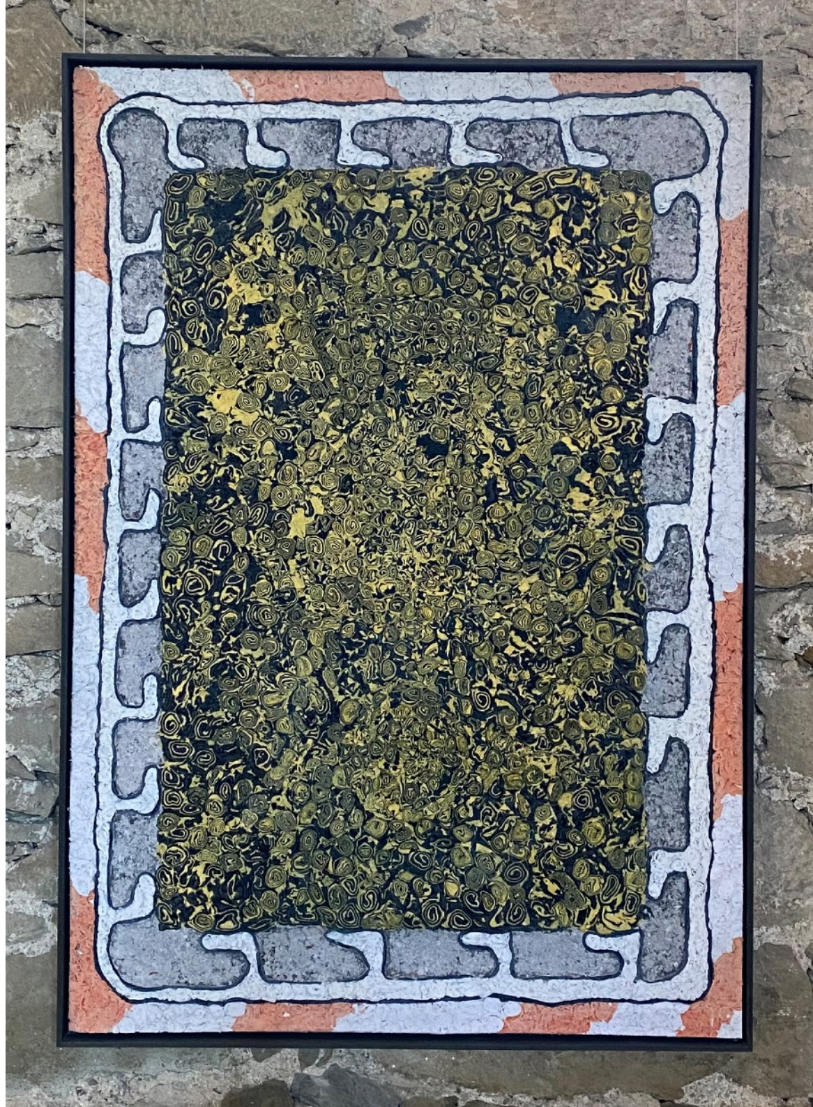
„Achtung“ , Textilstein, 100x140 cm