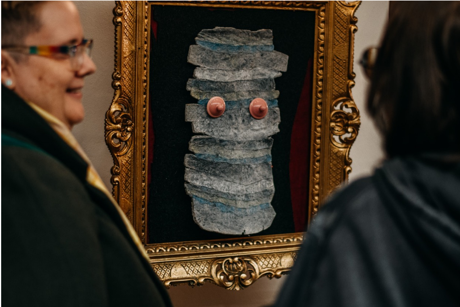
“Venus“, Textilsteinoton, pigment, fabric, 60x45 cm