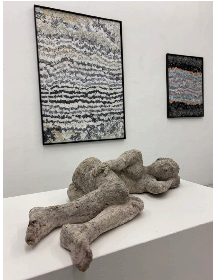
„female nude“, Textilsteinoton, 60x25x15 cm