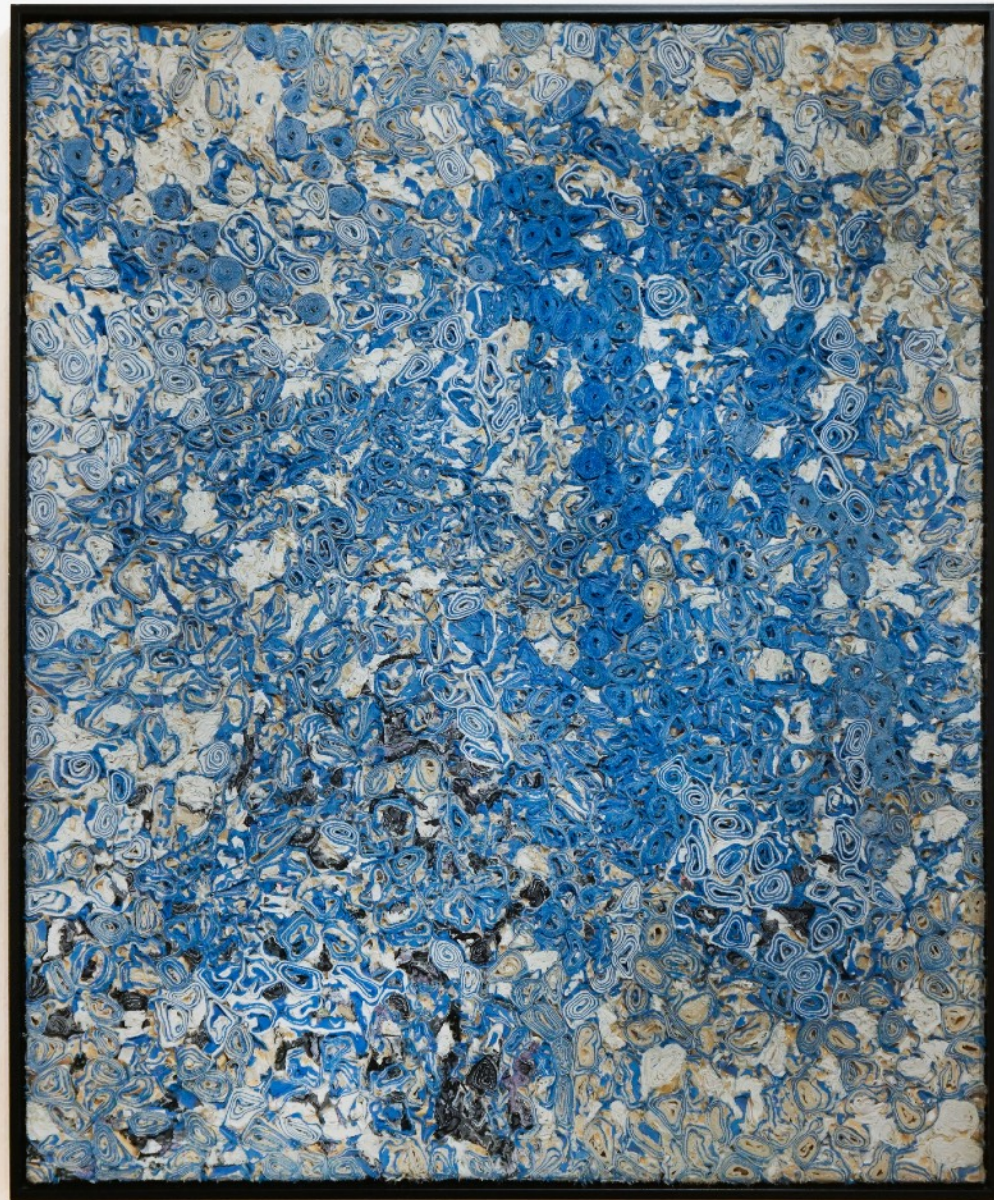
Florian Hoff Polychrom, 2024 Öl auf Leinwand 105 x 87 cm