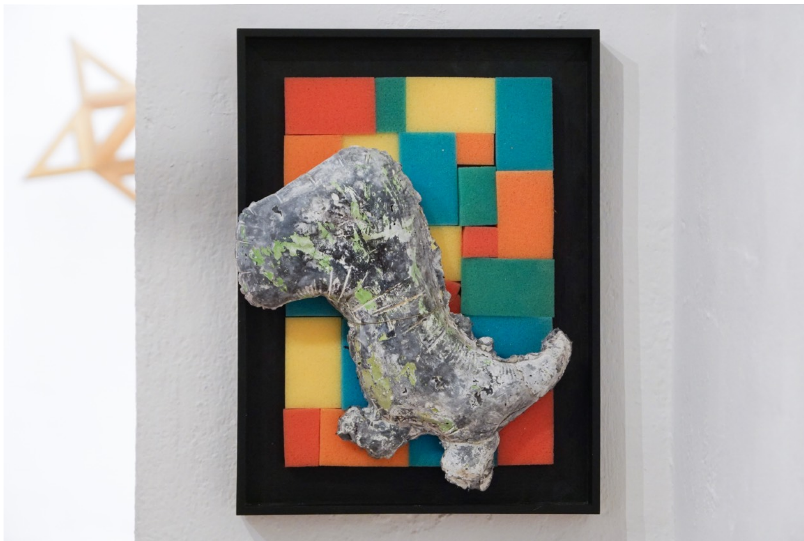
„Dino“ Textilsteinoton, Spülschwämme, 38x30 cm