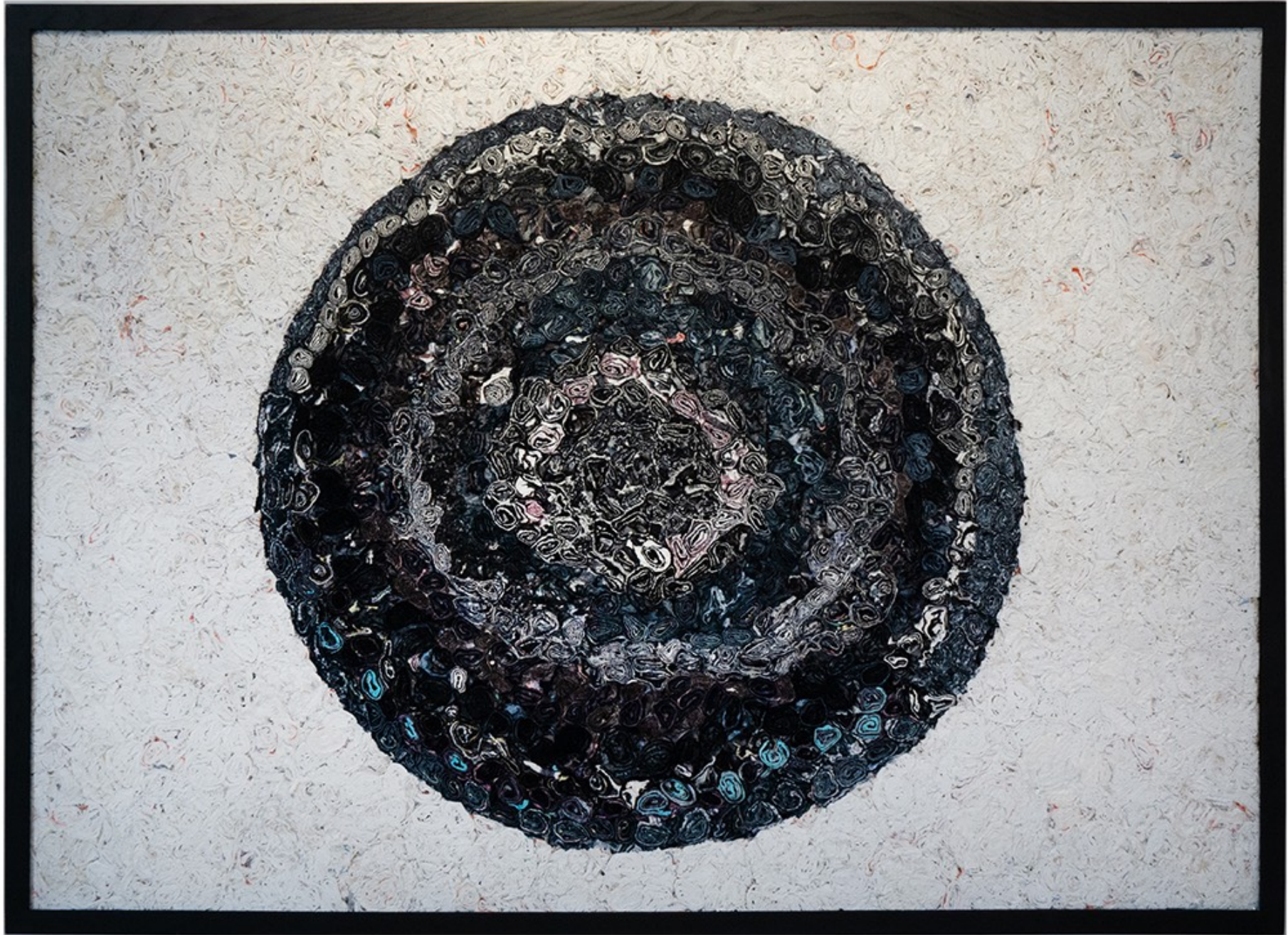
„O From Paris“, Textilstein, 100x140 cm