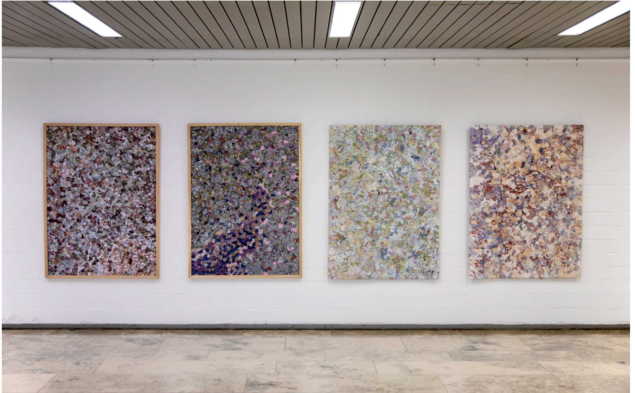
Exhibition: „O.T. (Original Textilstein)“ Max Plank Institut München/Martinsried 2020