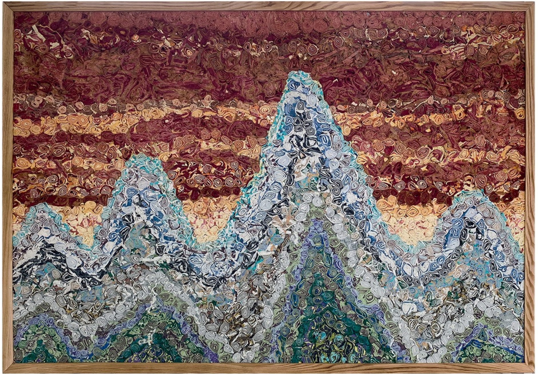
“Massiv:Fiasko“, Textilstein, 140x100 cm