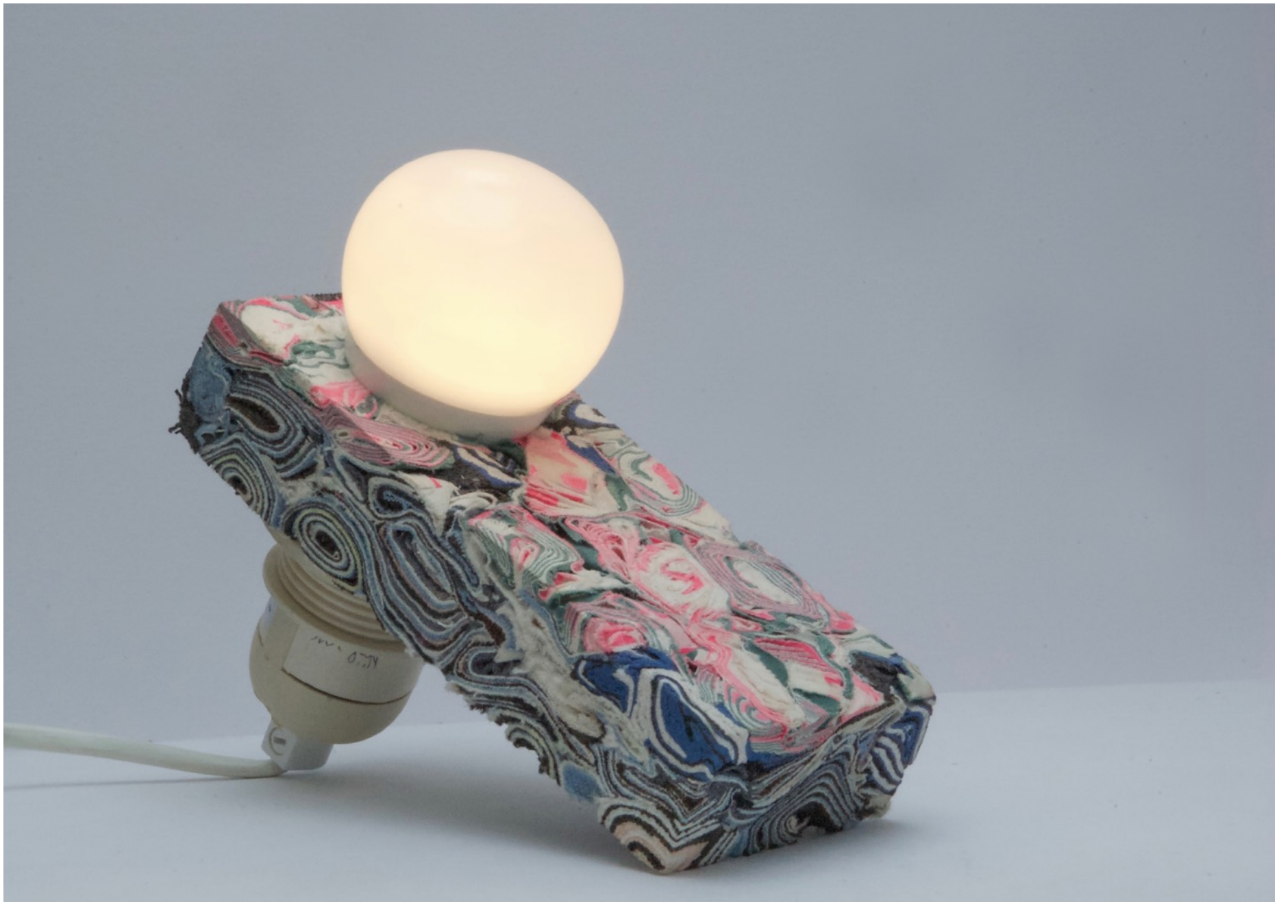
„TextilsteinLamp“, Textilstein, 16x6,5x3 cm