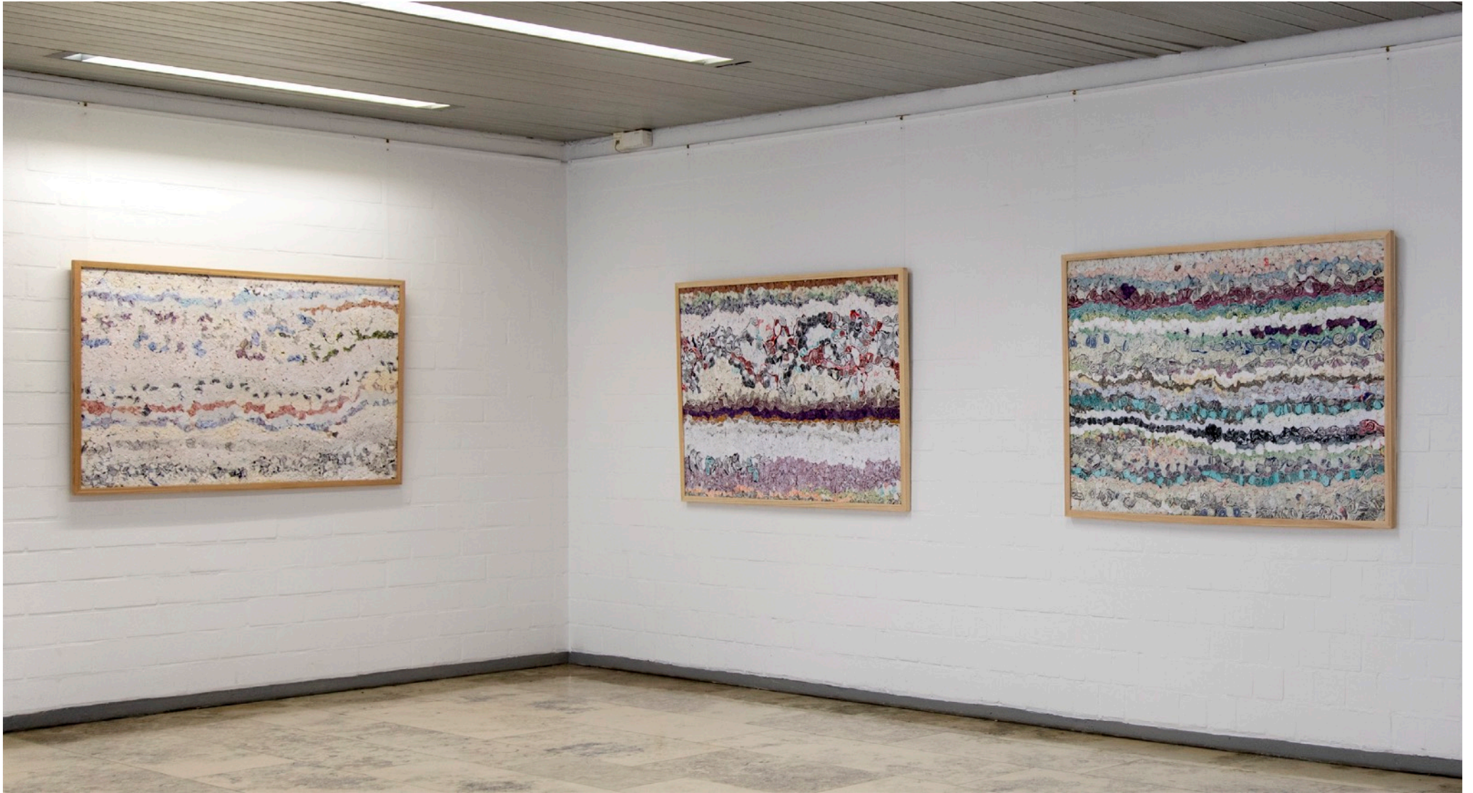
„Sedimentals“, Textilstein, a' 100x140 cm