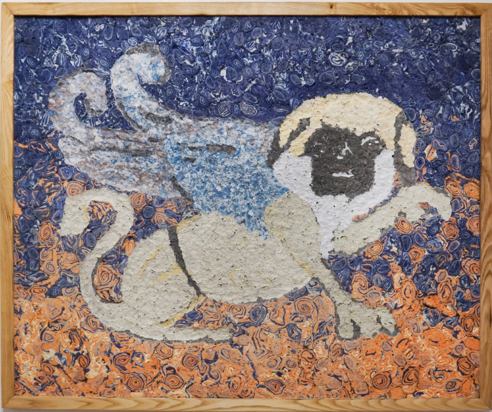
Florian Nörl Anemoia, 2025 Textilstein® Textilsteinoton 87x105 cm € 4.000