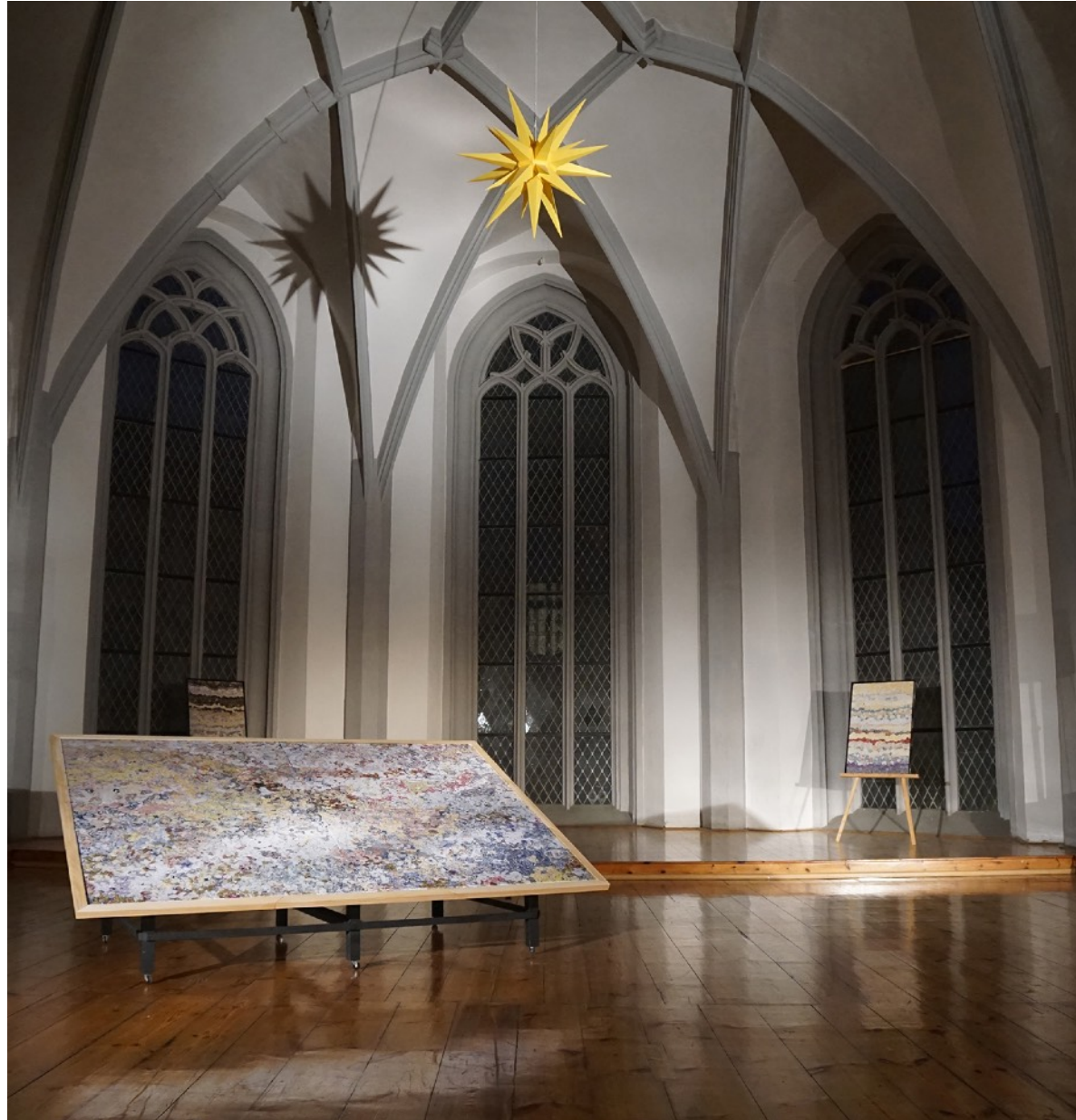
Exhibition: „los g e l ö s t“ (detached) Annenkapelle Görlitz 2022